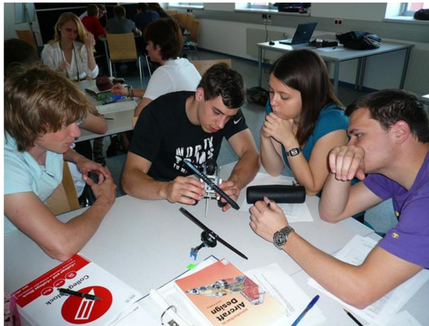
Figure 3: Students during the Discussion Phase Critically Examining Their LEGO® Technic Models

This phase was important for the consolidation of the vocabulary applied in the written abstracts and allowed for an expansion of technical terms by means of listening to explanations, reviewing design approaches and discussing critical issues. Students thus received the opportunity to describe their own models and ask questions or make suggestions about other teams' creations. Since this last phase of the task can be repeated as long as every student design team has matched up with every other team in class, oral practice and student talk time can be increased and the instructor receives additional flexibility concerning the question when to end the activity.