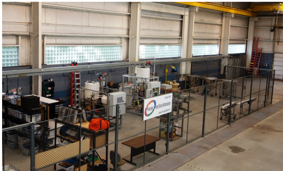
Figure 1. High Bay of the New Facility for Process and Data Automation

Recently, PDA moved their operations to within walking distance of the School of Engineering (see Figure 1). The new facility includes a high bay area that is designed for industrial processes, including an overhead crane, three-phase electrical power, and water access.