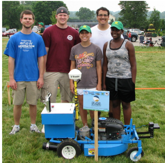
Figure 2. The Autonomous Lawn Mower Project

Due to the frame's simple design, reinforcing studs were placed along the runners which aid in supporting the weight placed in the middle of the vehicle. With these modifications the vehicle was able support roughly 200 lbs without showing any signs of stress, and was very stable during turns. However the overall weight was not enough for the tires to provide traction on soft surfaces. Unfortunately the tires did not provide good enough traction in grass or gravel, so golf spikes were inserted into the rear tires. With these changes the vehicle had better traction on most surfaces.