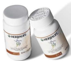
Figure 4: NRG GUARANÁ ( In Tablet and Powder Form) Peru