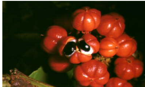
Figure 3: A Guaraná ( Paullinia cupana ); Inflorescences in Clusters.

Its fruit is a red capsule shaped as if it was an oval or a pear with a short peak. It has six containers shaped like ribs that keep the fruit together as one seed.