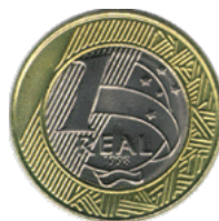
Figure 2: Official Currency

Regardless of the above, the distribution of income in the country is quite uneven and represents one of Brazil’s greatest problems. 5