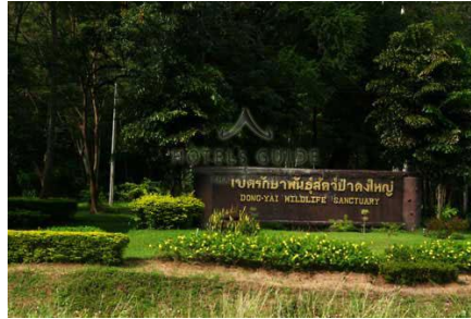
Picture 14: Dong Yai Wildlife Sanctuary ( www.hotelsguidethailand.com/trav...e%3D2257 )