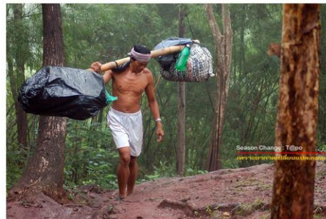
Picture 2: “Look-Harb” Villagers who Earn their Income by Carrying Things up the Hills for Tourists

In the past, local people grew corn and cassava, but now tourists are travelling within the area, bringing income to the community. For example, students in the community become young guides, people earn their income from selling products or being “Look-Harb” (Picture 2), and others become employees in resorts. However, some villagers who sell vegetables and fruits still need guidance from government officers regarding where to sell their products.