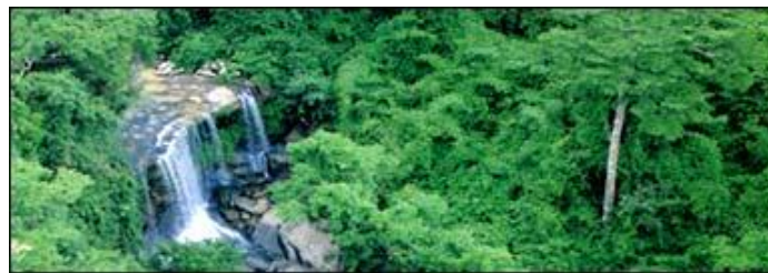
Picture 11: Pang Sida National Park ( http://www.dnp.go.th/parkreserve/asp/style1/default.asp?npid=101&lg=2 )