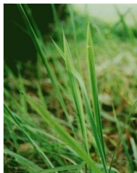
Picture 15: Cogon Grass being Illegally Collected by the Villagers

Regulations exist for tourists and villagers who break the rules. Tourists create little problems, such as throwing away garbage; but villagers create problems, such as deforestation, that are subject to punishment. They are warned when they collect forest products such as orchids and cogon grass (Picture 15).