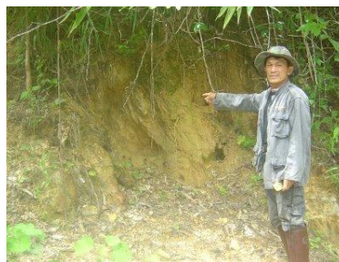
Picture 7: Artificial Pong, a Soil Mixed with Calcium for Elephants ( www.elephantreintroduction.blogspot.com )

This forest complex is 70% plentiful as it is the origin of the Mool and Bang Pakong rivers. It is a big reservoir which can absorb water by 50%. However, the community needs to manage it well because wild animals, such as elephants and gaur, come down from the forest for water in the summer. Because water and food may not be enough for them, government officers try to grow plants for them and create artificial food (Artificial Pong as shown in Picture 7).