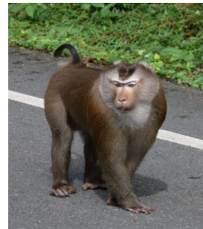
Picture 5: Pigtail Monkey Along The Road Waiting For Tourists To Feed Them