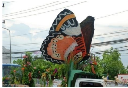
Picture 12: Butterfly Festivals held at Pang Sida National Park