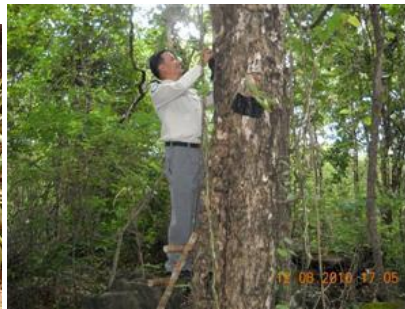
Picture 17: Special Project Bringing Dracaena to Dongyai Forest