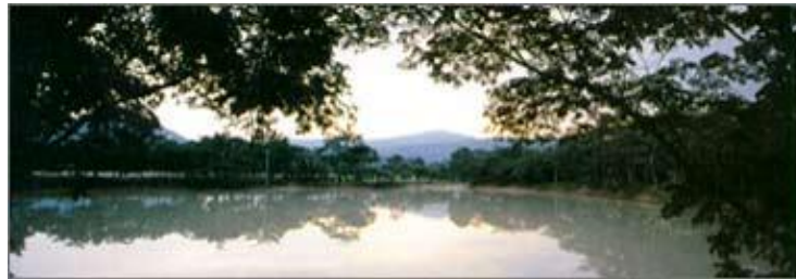
Picture 6: Thap Lan National Park