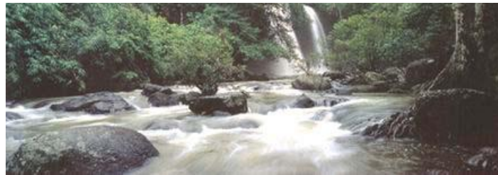
Picture 1: Khao Yai National Park ( http://www.dnp.go.th/parkreserve/asp/style1/default.asp?npid=9&lg=2 )