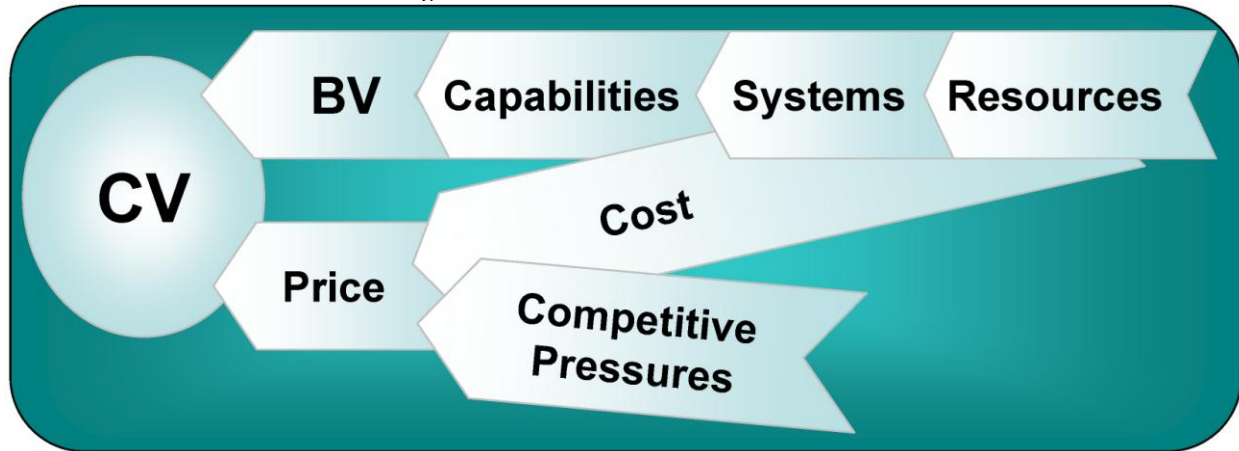
Figure 2: Generic Customer Value Creation

For illustrative purposes, Figure 3 maps R. C. Willey Home Furnishings' CV creation process circa 2000 (Valentin and Storey 2002). Valued benefits are shown above the dashed line. Circa 2000, they convinced myriad Utah consumers that R.C. Willey was the first and, perhaps, the only store they needed to visit when shopping for furniture, major appliances, home entertainment gear, and many other durable household items.