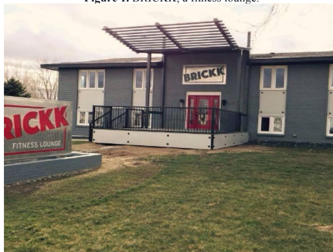
Figure 1. BRICKK, a fitness lounge.

Pavlik opened the club in April 2016. Attendance at group fitness class continues to grow, with the more popular classes approaching and sometimes exceeding the suggested limit of 25 participants per class.