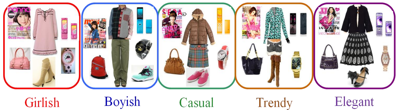
Figure 2: Collage Boards

This allowed preferences to be grouped into five categories - girlish, elegant, casual, trendy and boyish - like those shown in Figure 2. As shown in Table 1, each board is given a single image word that best captures the style shown. Respondents then selected domestic and foreign vehicles from those seen during the crowd-watching phase that they subjectively thought matched the clothing on each collage board.