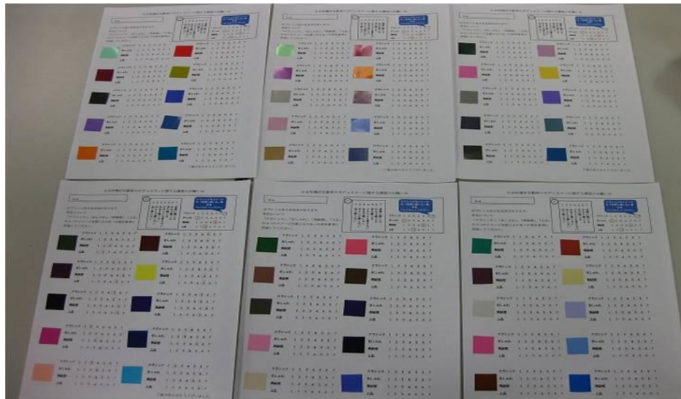
Figure 3: Subjective Color Survey Sheets

Each respondent was asked to select one of the six sheets at random, so that each person rated ten colors on a seven-point scale according to how much the color seemed luxurious, stylish, high-end, or chic. PANTONE color samples were used for the survey.