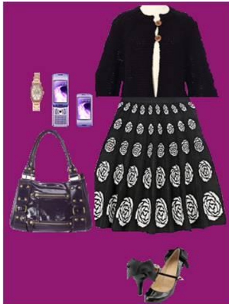
Figure 5: Colors that express “Elegance”