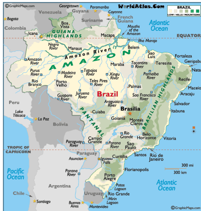
Figure 2: Map of Brazil

Congressional initiatives in Brazil have encouraged poor farmers to settle on forest lands. In Brazil, each squatter acquires the right to continue using a piece of land by living on it and “using it” for at least one year and a day. After five years, the squatter acquires title to the land and can even sell it. Up until the mid-1990’s, the government allowed the squatter to gain title to an amount of land up to three times the amount of forest cleared. Between 1995 and 1998, the government granted land in the Amazon to approximately 150,000 families. In June, 2009, Brazilian President Lula signed a law granting 67.4 hectares of land in the rainforest to more than 1 million illegal settlers (Butler, 2009). Thus, these actions have helped to engage more Brazilian citizens in agriculture, which helps to feed the poor and the nation, and to develop more of the country, but has also contributed to more deforestation of the Amazon jungle.