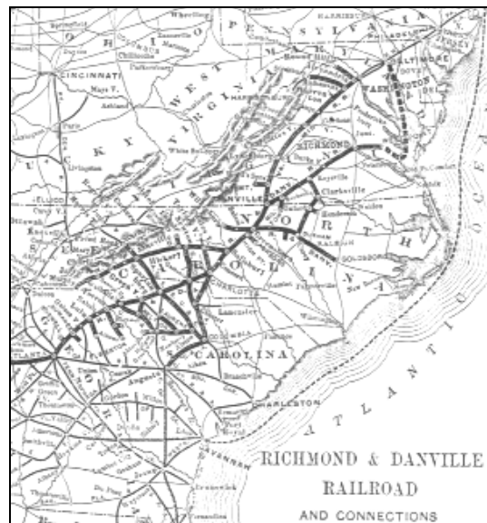
Figure 1: The Richmond & Danville RR, circa 1892

The Richmond & West Point Terminal Railway & Warehouse Co. (“the Terminal Co.”) was organized in 1880 to enable the Richmond & Danville RR (“the R&D”) to consolidate its control of a system of railroads in the southeast portion of the United States, generally running from Alexandria and Richmond, VA, to Atlanta, GA (see Figure 1).