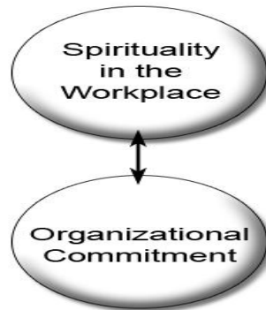
Figure 1: Model of the relationship between Spirituality in the Workplace, Organizational Commitment

Organizational commitment is an important variable that has been established as relating to individuals and organizational performance. The independent variable in this study is organizational commitment and the dependent variable is spirituality in the workplace.