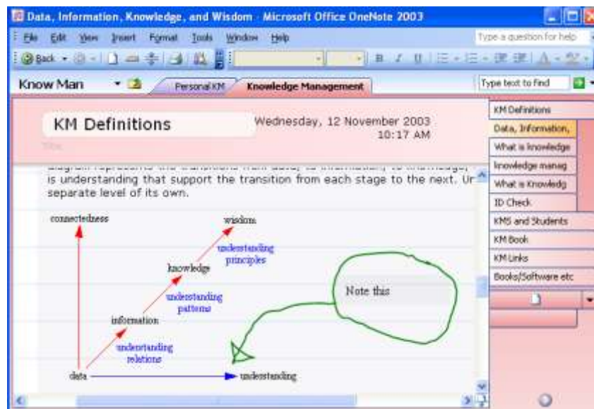
Figure 2: Microsoft OneNote

OneNote also has facilities for simple diagramming and for recording audio notes. A typical page is shown in Figure 2.