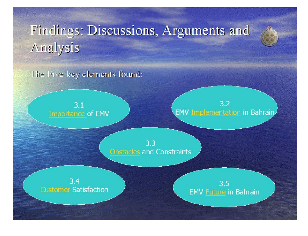
Figure: 3 The Five Key Elements