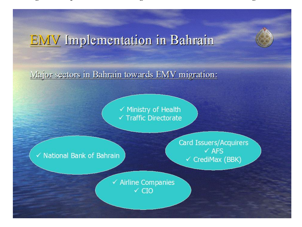
Figure: 4 Major Sectors in the Kingdom of Bahrain towards EMV Migration

• However, a full project team was established by AFS company (Issuer) with a major strategy included gaining knowledge prior to the migration plan, acquiring hardware and software, and hiring new people such as training consultants (SIMETRIC) nominated by Visa International Organization. So, their major steps of strategy development were changing software applications, personalization, purchasing hardware and training. AFS also chose different suppliers such as IBM for main machines, NBS for embossing and personalization, and BAYSYS for software applications and upgrading. "AFS is now ready and has become an EMV compliant in the third quarter of 2004." Said Mr. Ghazi M. AbdulJawad, the Chairman, AFS and Mr. Nass.