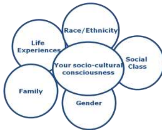
Figure 1: Socio-cultural Consciousness (adapted from Villegas & Lucas, 2002)

Socio-cultural consciousness (Figure 1) is the awareness that the way in which one sees the world is not universal, but is significantly molded by one’s life experiences, tempered by such variables as race, ethnicity, social class and gender. Understanding that an individual’s perspective of these variables is more a representation of personal experiences, and that they may not be shared by others, is a prerequisite for effective communication in a multicultural society (Villegas & Lucas, 2002). On a continuum of socio-cultural consciousness or dysconsciousness, we mirror our personal experiences and views of the world in our teaching.